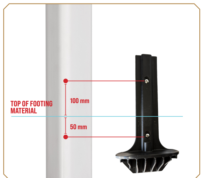
Angular Footings Bracket