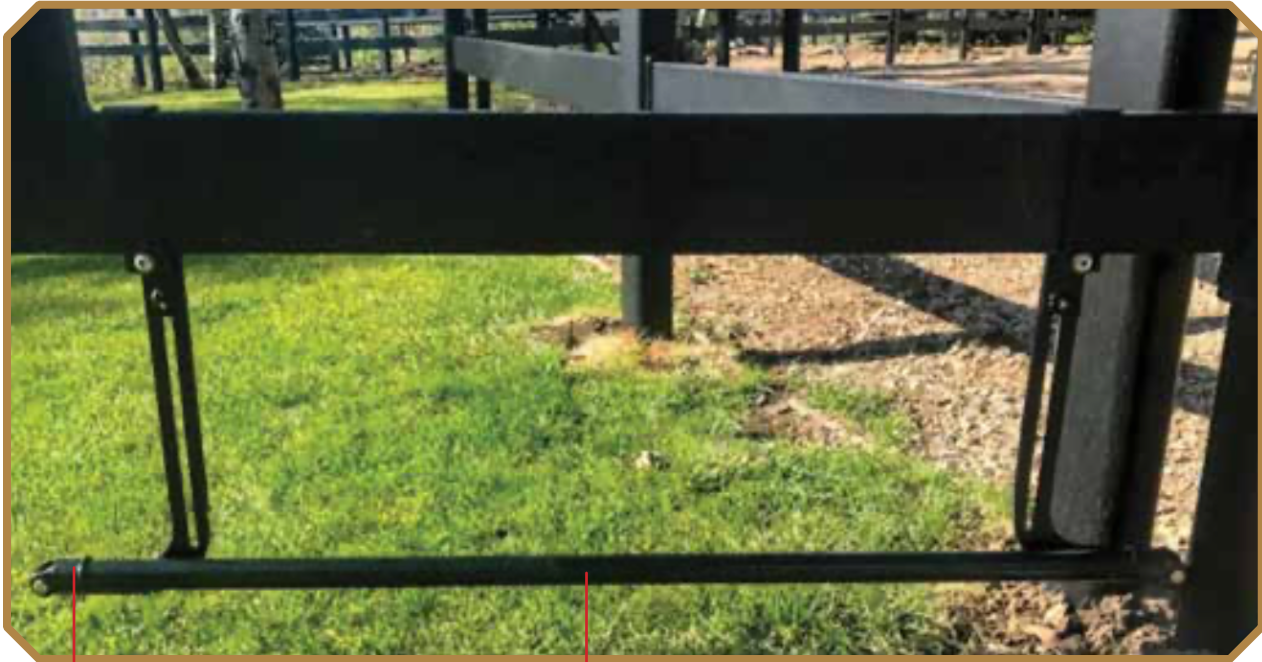
STEEL TUBING WITH CAP ENDS