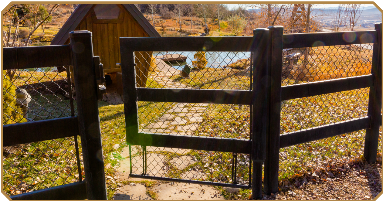
VERTICAL TENSION BAR