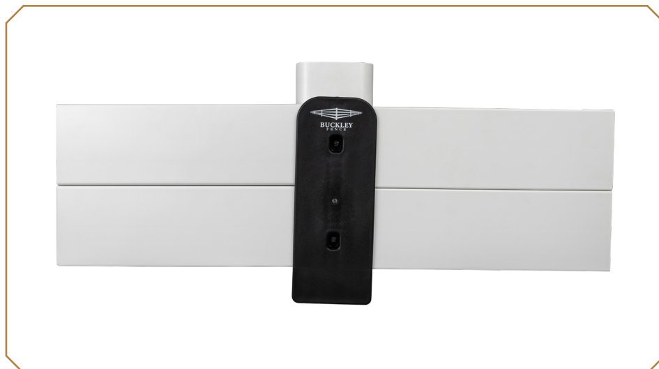
Linear Footings Bracket