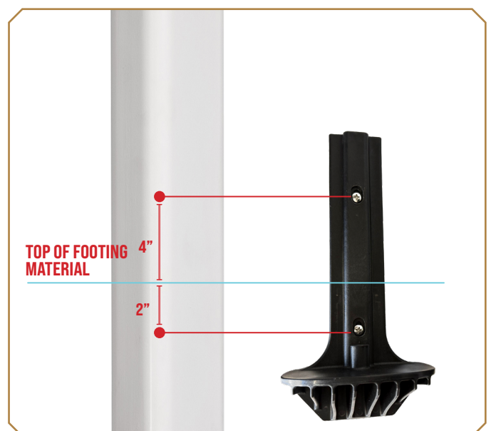
Angular Footings Bracket