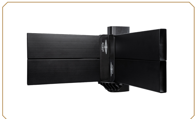
Angular Footings Bracket