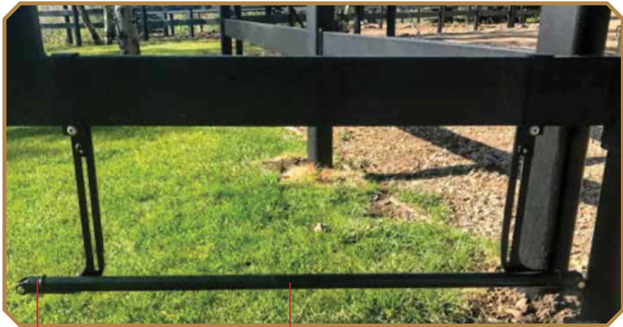
CHAIN LUNK TUBING WITH CAP ENDS