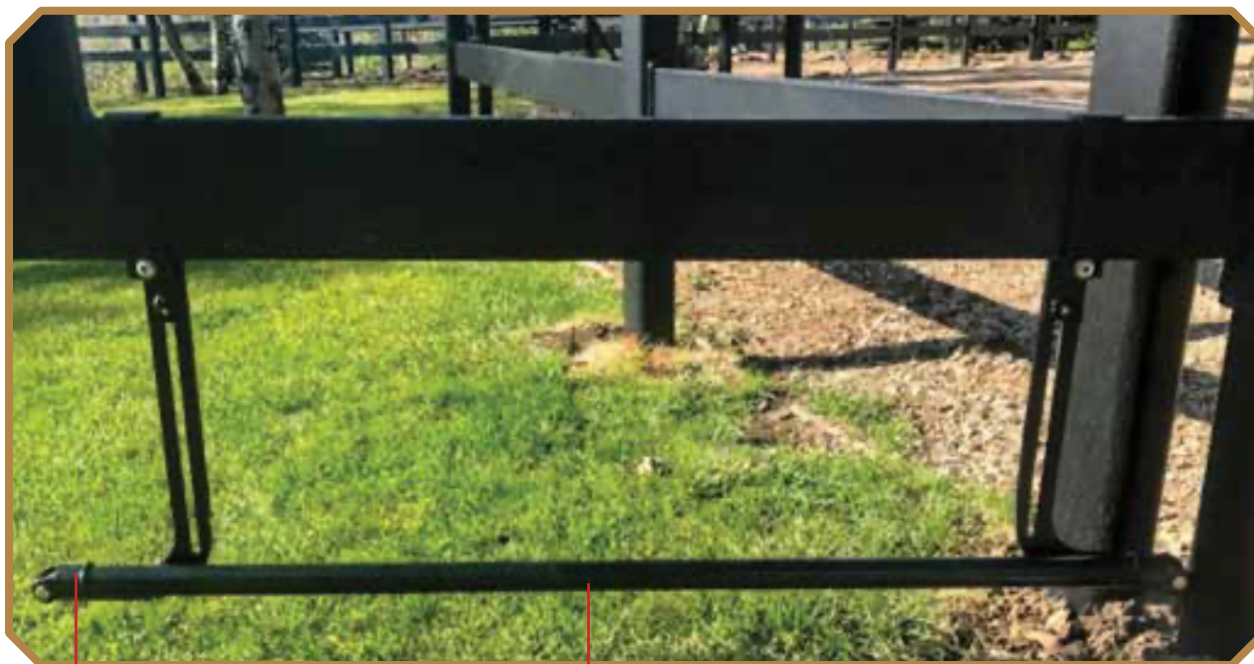
● CHAIN LUNK TUBING WITH CAP ENDS